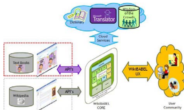
Fig 1: Functional Architecture of WikiBABEL

WikiBABEL is architected as a browser based application that may be deployed on any wiki-site, and the current beta version is architected specifically for Wikipedia. Figure 1 outlines the functional architecture and the components.